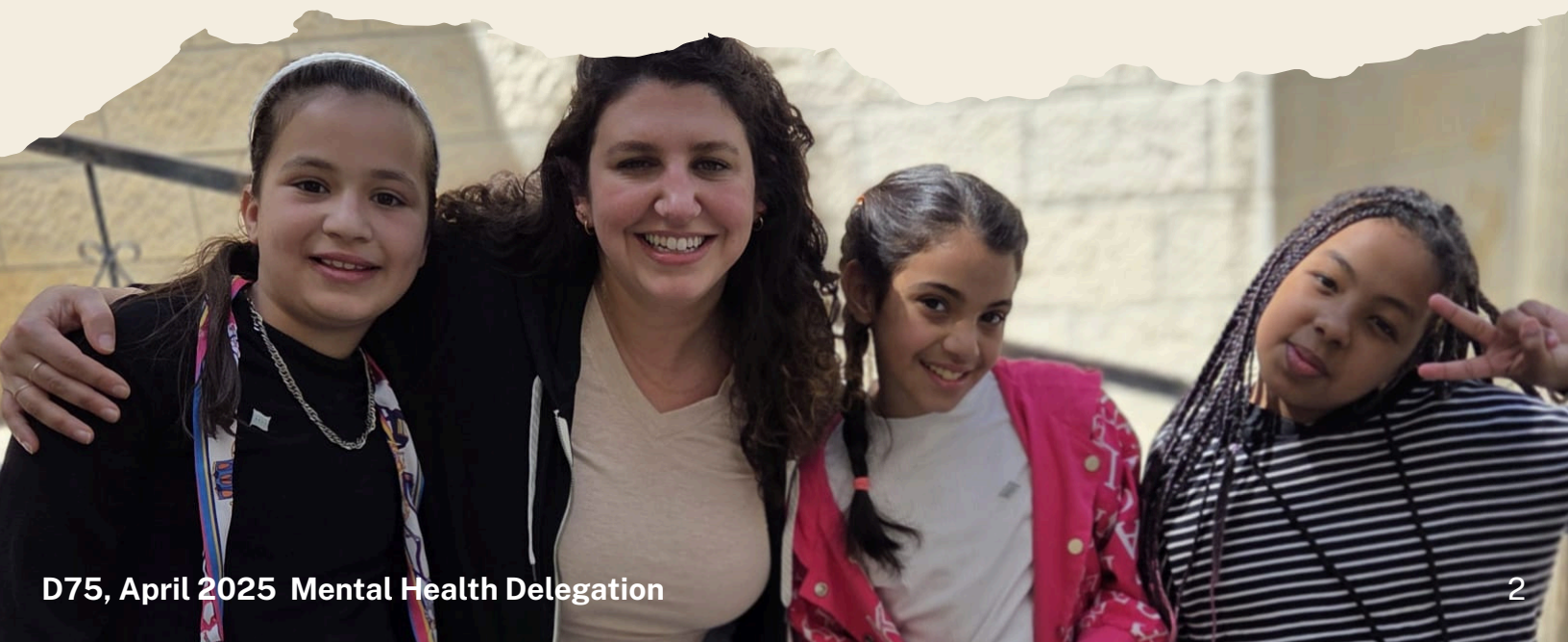
D75, April 2025 Mental Health Delegation