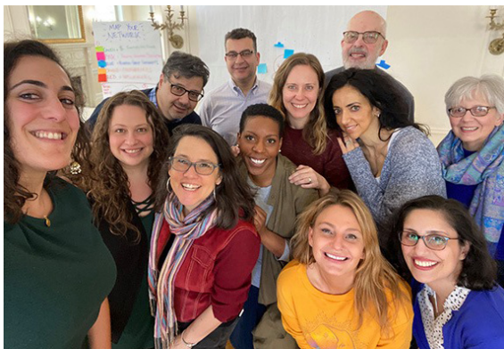
Eyewitness Palestine Board and Staff during our annual Board retreat.