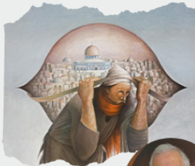
SLIMAN MANSOUR ARTIST