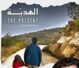
SALEH BAKRI ACTOR